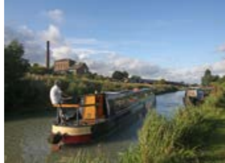
Kennet & Avon Canal

The Great West Way connects England's icons. But is also reveals everyday England.