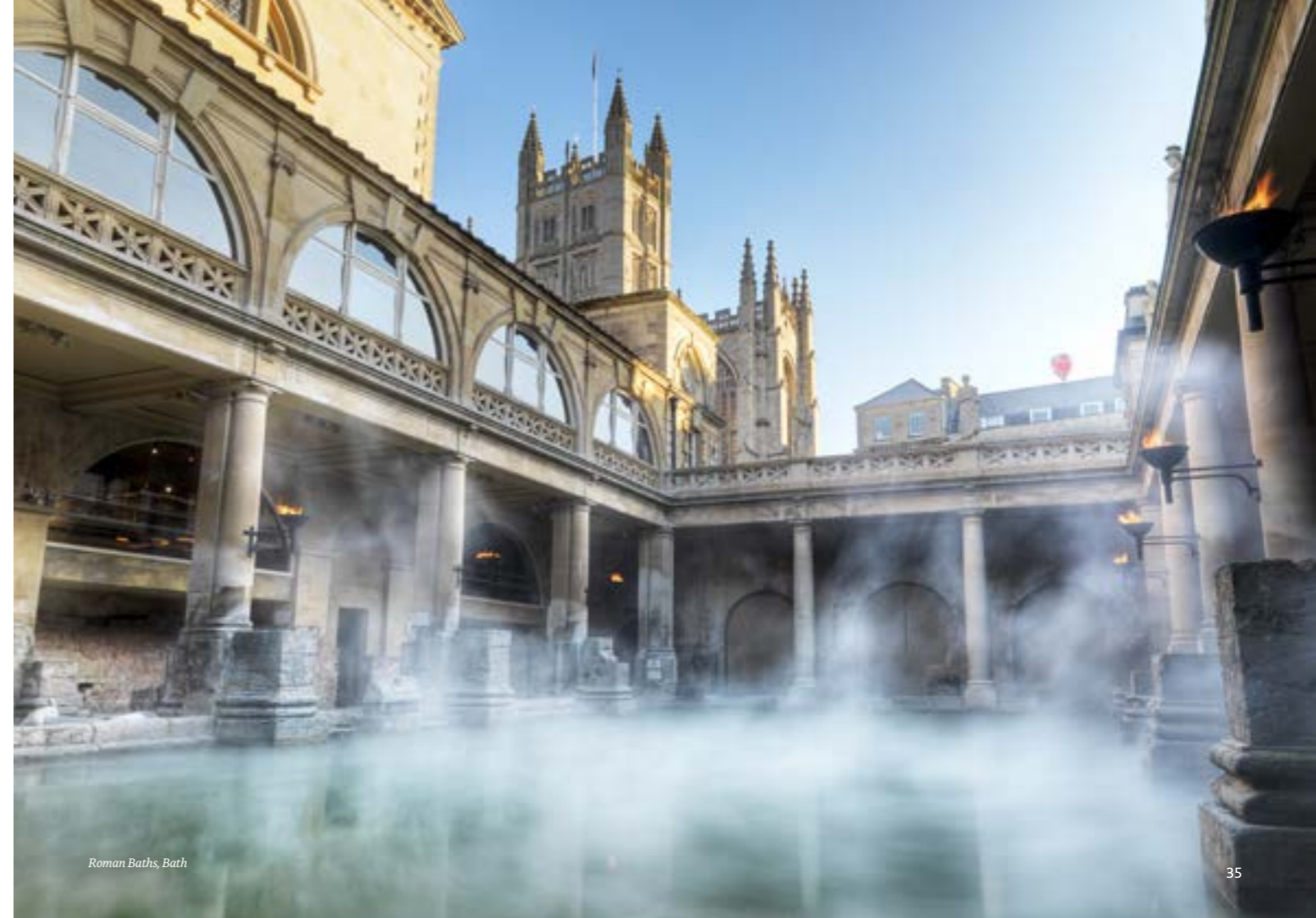
Roman Baths, Bath