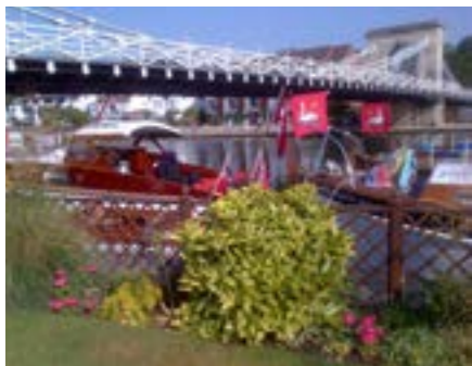
Swan Upping Boats, Marlow

To be true to the Great West Way brand idea, visitor experiences should always help reinforce these messages.