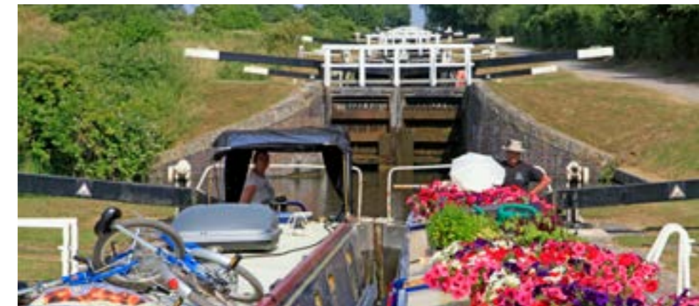
Caen Hill Locks, Kennet & Avon Canal

“It’s about links. Honeypots are seen as separate destinations. But joining them together makes it more of an adventure.”