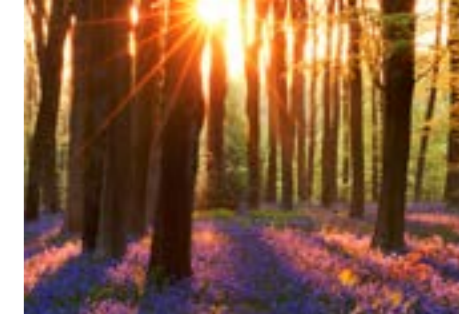
Bluebell Wood, near Pewsey

To help develop a clear and motivating proposition, we also spoke to partners and stakeholders across the Great West Way route. We are grateful to everyone who took the time to share their advice and experience with us, whether individually or at a Great West Way Workshop.