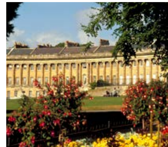
Royal Crescent, Bath

Netheravon and Larkhill. And then we arrived at one of the most instantly-recognisable monuments in the world - Stonehenge. As we wandered our way from the visitor centre to the stone circle (there's a shuttle bus if you want to save your legs), we did ponder its purpose. A signal for aliens? Cemetery? Ancient healing ground? A temple for sun worship? We were still no clearer when we came away several hours later. But the mystery is probably Stonehenge's biggest appeal, we figured.