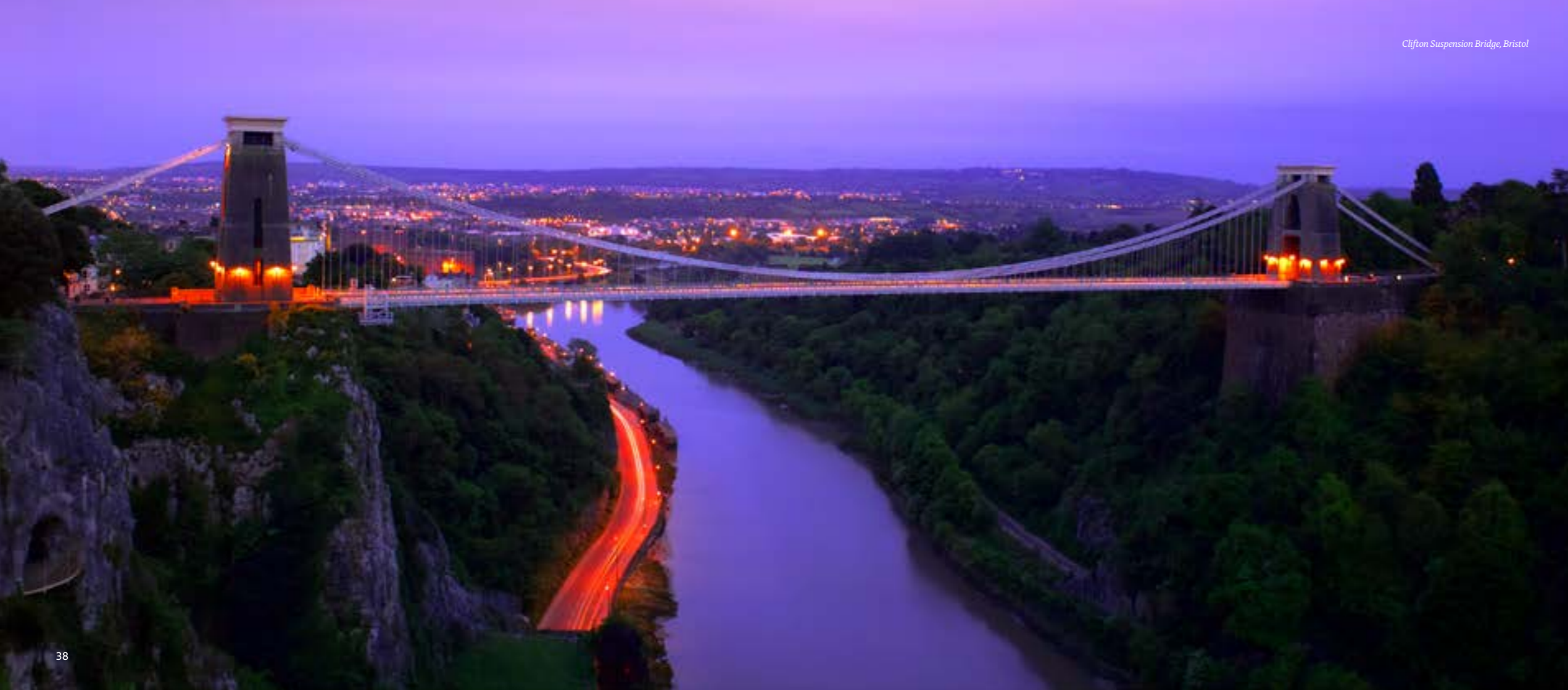
Clifton Suspension Bridge, Bristol

Front Cover: Castle Combe, Cotswolds Back Cover: Kennet & Avon Canal