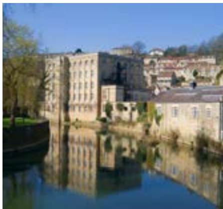
Bradford on Avon

Arriving in the UK by ferry, we used the Great West Way as a base from which to explore England's highlights.