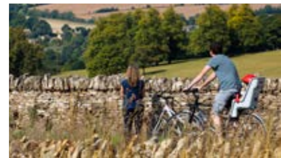
Touring the Cotswolds

Our present is important. With so many things happening along England’s Great West Way, now is always the time to visit.