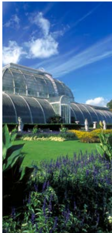
Royal Botanic Gardens, Kew

From the 19th century wind your way along the Great West Way further and you'll wind the clock back too. In Wiltshire you'll find