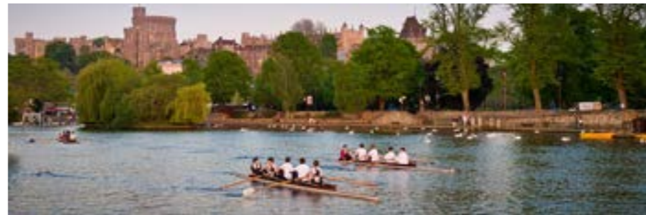
Rowers on the River Thames at Windsor

I am sitting on the grass, droplets of dew gently soaking into my skirt. Towering above me is a vast and ancient stone, standing tall above the grass and the nonchalantly munching sheep of Avebury, solid and stately in its place within the largest stone circle in Europe.