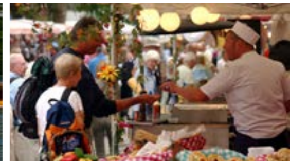
Bristol Harbour Market, Bristol

I am exploring the Great West Way, a corridor that runs through the very soul of