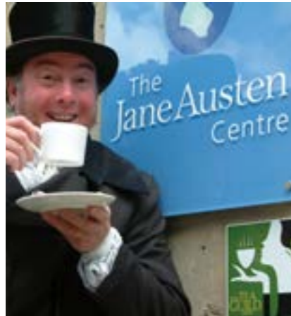
The Jane Austen Centre, Bath

The Great West Way makes it easy for visitors to get to know our part of England.