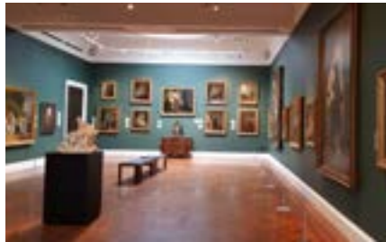
Holburne Museum, Bath

Bath pretty much ticks all the boxes for a great weekend break. Its setting and architecture makes it a strong contender for England's most beautiful small city. Bath also makes an ideal base from which to explore the Great West Way. And nearby Bristol provides the contemporary yin to Bath's ancient yang.