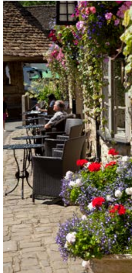
English village life