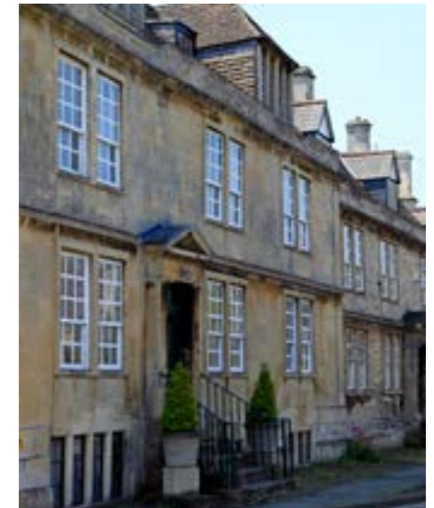
The Green, Calne