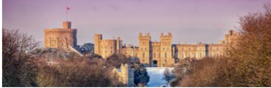
Windsor Castle, Windsor