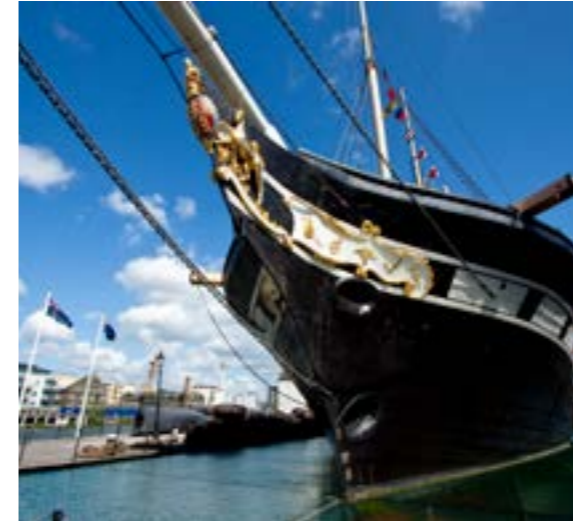
SS Great Britain

As we headed back towards London, the conversation was all about the new people and places we'd experienced on this trip. Discovering this beautiful part of England under our own steam has made us feel like we've become England 'insiders'. How long we can keep the Great West Way a secret from our friends, though, is another thing!