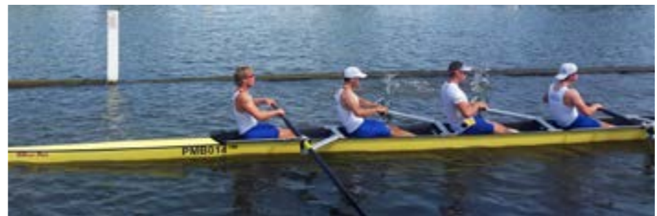
Henley Royal Regatta

“Joining things up and taking a list of disparate and sometimes disjointed attractions and transforming them into a seamless product that will become a well-trodden path.”